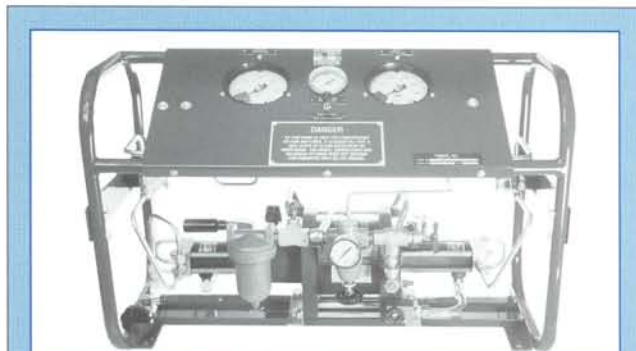
32" long x 14" wide x 24" high Approx. weight: 115 lbs.